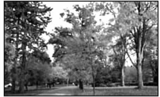
Autumn in Sudbrook Park continues to offer respite for the spirit 120 years after Frederick Law Olmsted, Sr. designed this residential development.